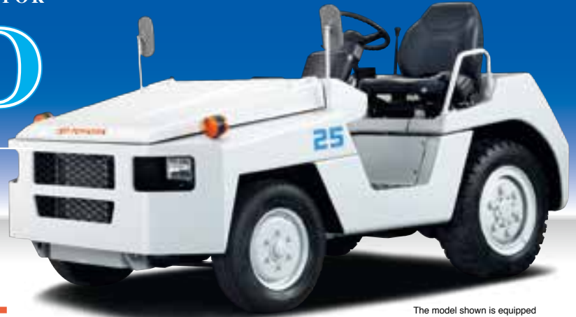
The model shown is equipped with optional equipment.